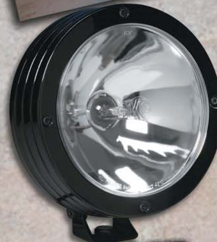
Rally 800 HID